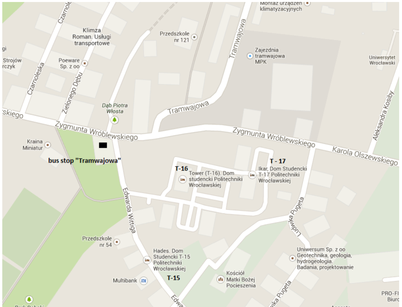
Fig. 1a Localization of the dormitories

How to get to dormitory T-15 (Wittiga Street 6),16 (Wittiga Street 4),17 (Wróblewskiego Street 27)? Location of the dormitory you can find also at google maps writing “Wittiga 6/Wittiga4/Wróblewskiego 27, Wrocław city”).