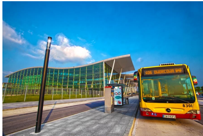
Fig. 2. Bus stop at the airport

Step 1. Take the bus no. 406 from the Airport (fig. 2) to the last bus stop "DWORCOWA" near Wrocław main railway station (fig. 3). The trip takes about 30 minutes. Bus 406 goes every 20 minutes. You can buy single normal ticket which costs 3,00 PLN or 30, 60 or 90-minutes ticket (using ticket vending machines in each bus or tram).