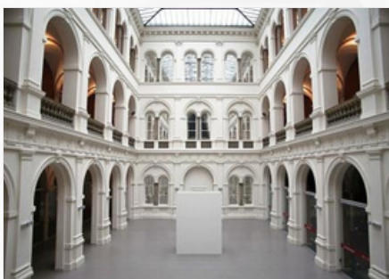
National Museum Time-wide art. collection