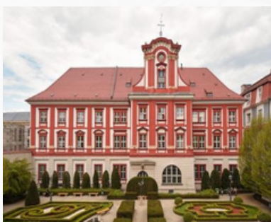
Ossolineum Internal court and garden