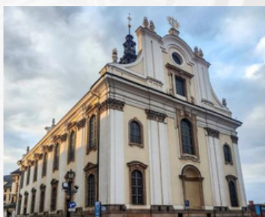
University Church A spectacular church in Wrocław