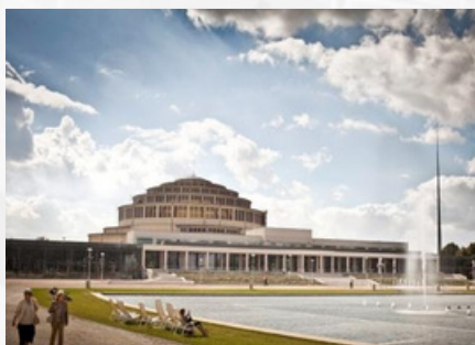
Centennial Hall UNESCO legacy building