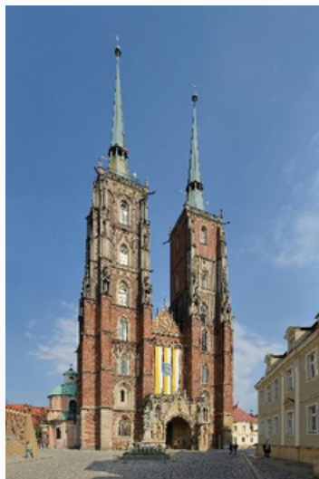
Cathedral of St. John Baptist