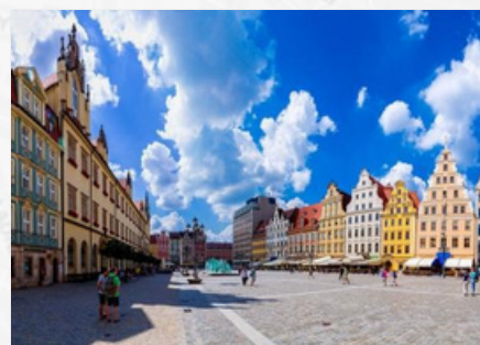
Market Square Wrocław city centre