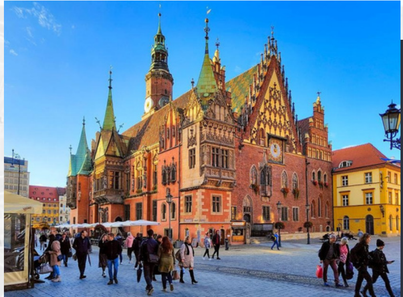
City hall of Wrocław

Wrocław is one of the oldest cities in Poland, located in Lower Silesia by the Oder river. Its origins date back to the 9th century, when a Slavic settlement called Wrotizla was founded. Throughout its history, Wrocław was the capital of the Duchy of Wrocław and one of the most important cities in Silesia. In the 13th century, the city obtained its city rights, and in the 17th century, it became one of the largest Protestant centers in Europe.